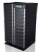
100-120 kVA + Battery Cabinet