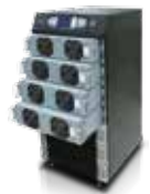
Scalable and Hot-swappable